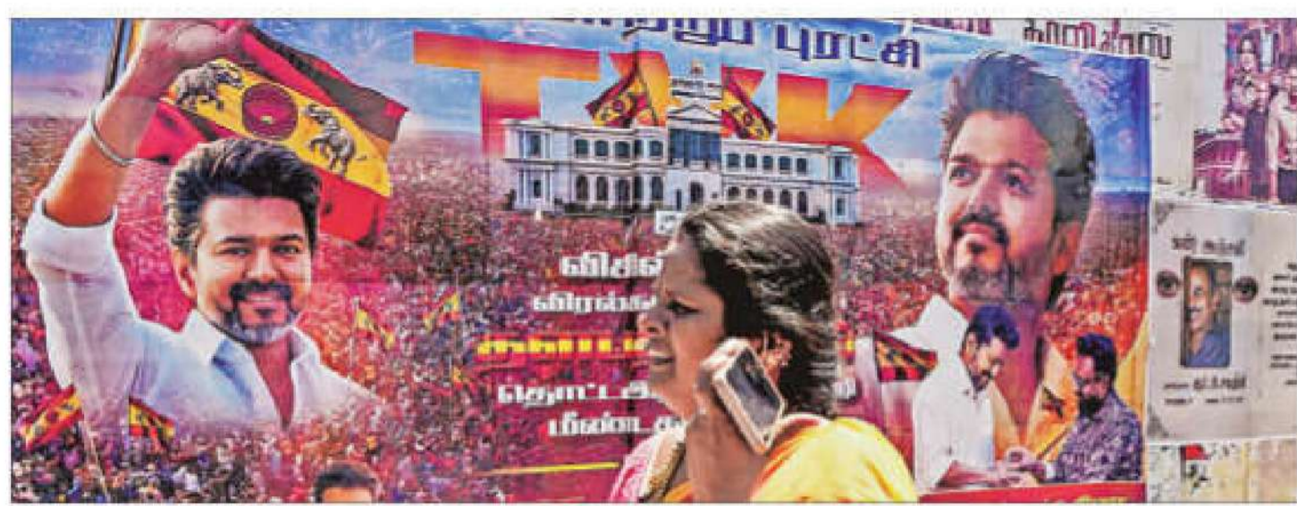
A woman walks past a banner of TVK chief Vijay after his party emerged as the single-largest party in the Tamil Nadu Assembly elections. The Governor rejected his claim to form the government

Vijay visited the Lok Bhavan, based on an invitation from Governor Arlekar, for the second time in 24 hours. "During the meeting, the Hon'ble Governor explained that the requisite majority support in the Tamil